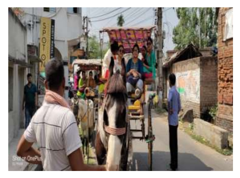
Horse Carriage Ride