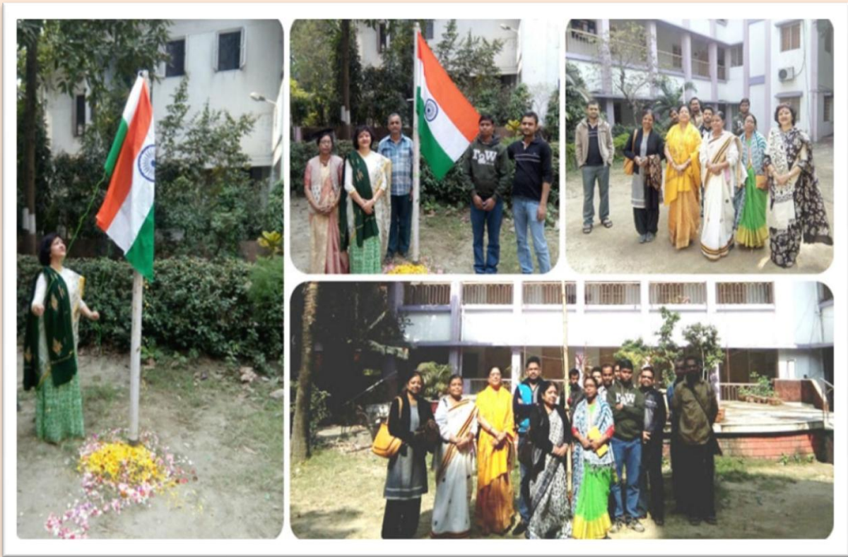
Celebration of Republic Day (26 th Jan)