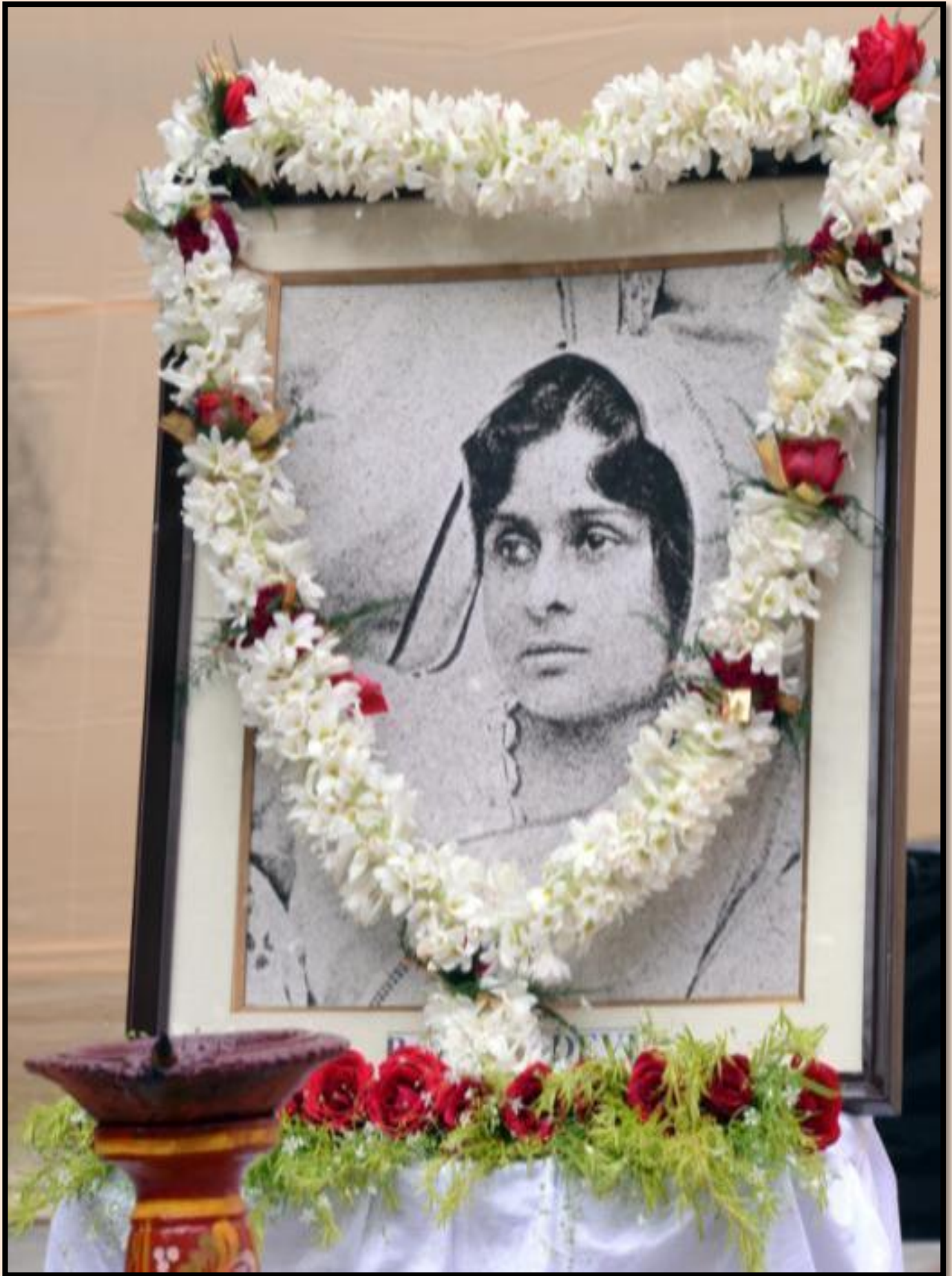
BASANTI DEVI (1880 – 1972)