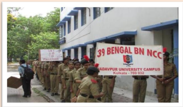
NCC Team at Jadavpur University