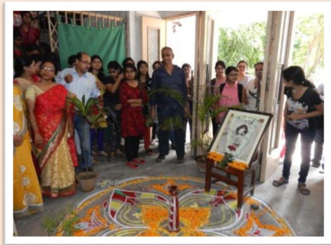
Celebration of College Foundation Day (5 th August)