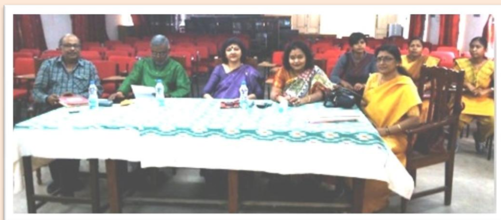
IQAC Meeting with the external GB members