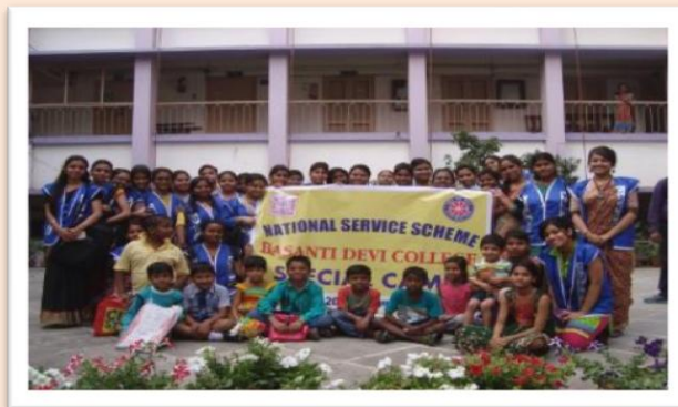
NSS Special Camp