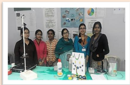
Exhibition by students